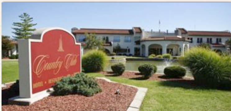
Country Club Hotel & Spa www.countryclubhotel.com