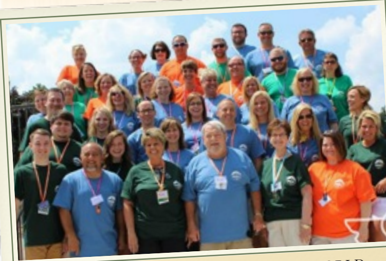
STUCO ADVISOR - BEST JOB IN THE WORLD

Week long leadership training, full of hands on, active, and high-energy learning opportunities. Includes: problem solving, project planning, self-esteem, team-building, large and small group activities.